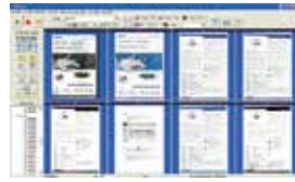
The AVScan X main screen

The Intelligent Document Management Tool