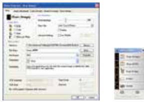
The Button Manager V2 main screen

Button Manager V2 makes it easy for you to scan and send your image to your favorite destinations with a press one button. Now the new version comes with an innovative feature to let you scan and automatically upload the scanned document to popular cloud repositories such as Google Docs, Microsoft SharePoint or FTP. In addition, the iScan feature allows you to insert the scanned image or recognized text after optional OCR (Optical Character Recognition) process to your text editor such as Microsoft Word to get your job done easily and quickly.