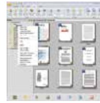
The PaperPort SE14 main screen

The Professional Choice to Organize and Share Your Documents