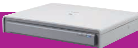
A3 Flatbed Scanner unit 201