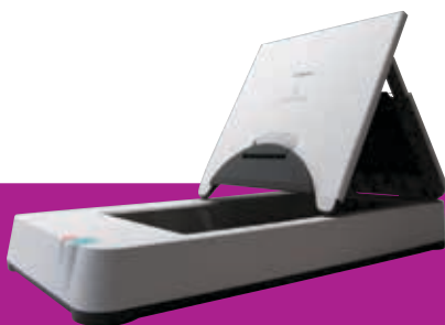
A4 Flatbed Scanner Unit 101

Scan bound books, journals and fragile media by adding the Flatbed Scanner Unit 101 for documents up to A4 or Flatbed Scanner Unit 201 for A3 scanning. Connected by USB, these flatbed scanners work seamlessly with the DR-G1130 and DR-G1100 in a smooth dual-scanning operation that lets you apply the same image-enhancement features to any scan.